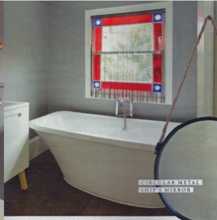
CIRCULAR METAL SHIP'S MIRROR