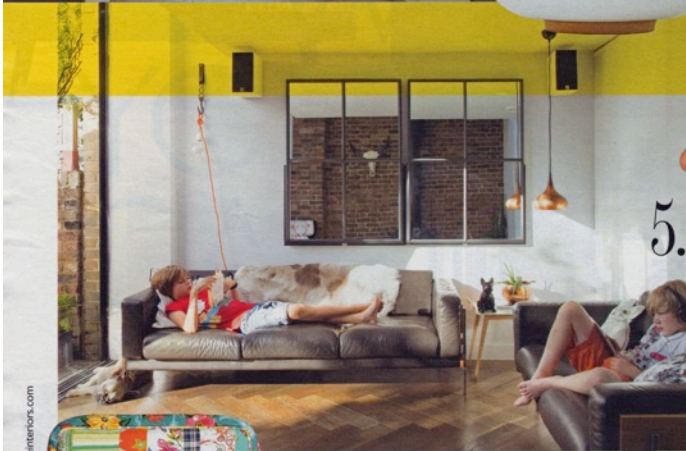
NORDLUX FLOAT BRUSHED COPPER PENDANT