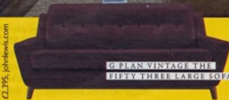
GIPIAN VINTAGE THE FIFTY THREE LARGE SOFA